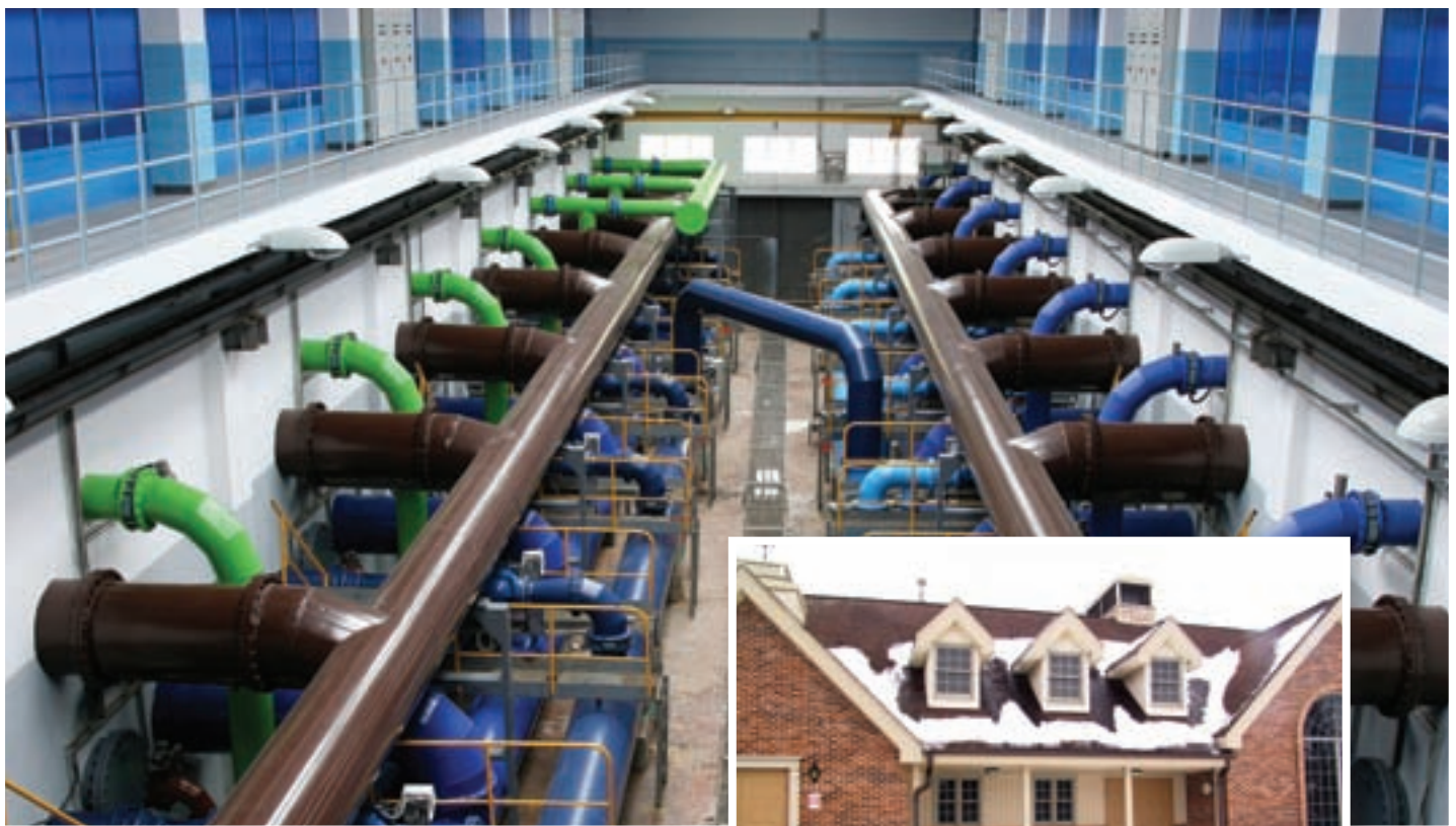
inside a water treatment plant